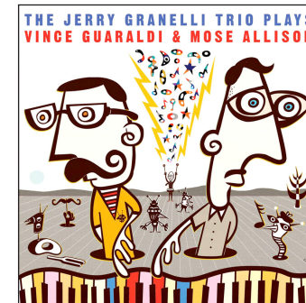
JERRY GRANELLI— Plays Vince Guaraldi & Mose Allison (RareNoise)