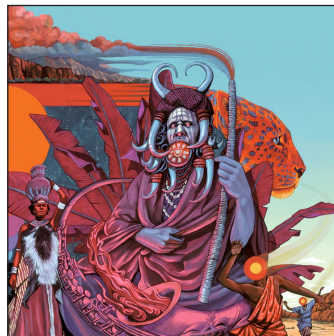
IDRIS ACKAMOOR & THE PYRAMIDS— Shaman! (Strut)