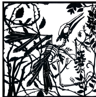
CYANOTYPE— Birdsongs of the Necromancer (Out & Gone Music)